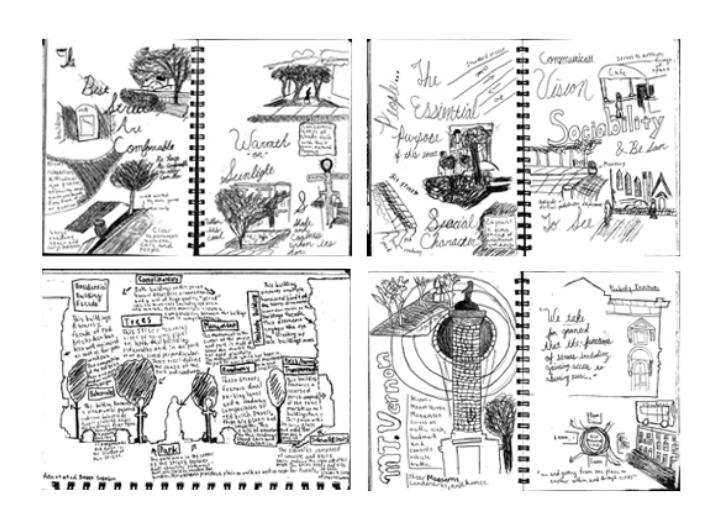
Figure 1: Illustrative journal entry analysis of place making in Mount Vernon Historic Neighborhood of Baltimore. Concepts and Theory of the Built Environment, Fall 2014, Instructor: Gabriel Kroiz.

In ARCH 101 Concepts and Theories of the Built Environment, students explore two thematic aspects of architecture and the built environment – 'Place Matters' and 'Place Makers'. The latter introduces specific disciplines and individuals, women